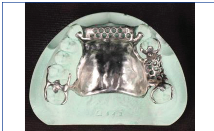
[Table/Fig-2]: Cast Partial Denture (CPD) after finishing and polishing.