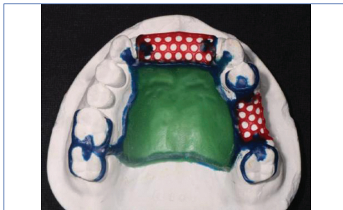
[Table/Fig-1]: Wax pattern for manual casting.

Assessment of castability: The mesh grid minor connector design satisfies the previously mentioned criteria and facilitates the simple visualisation and assessment of the casting [20]. The mesh grid minor connector design was used to evaluate castability, a method proposed by Whitlock RP et al., [21]. The castability percentage was calculated by counting the number of fully cast lattice framework holes before and after fabrication. This method offers a quick, visual, and quantitative assessment of alloy reproducibility in both manual and DMLS techniques.