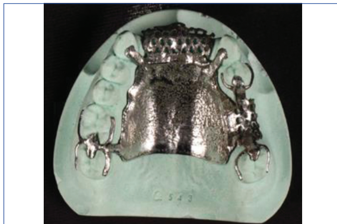
[Table/Fig-4]: DMLS printed CPD framework.